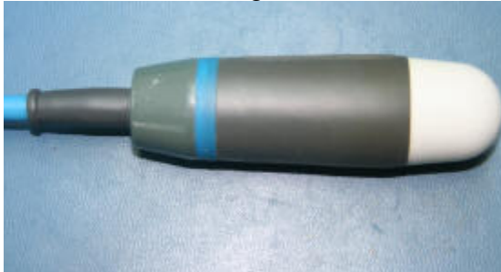
50S Tringa Probe