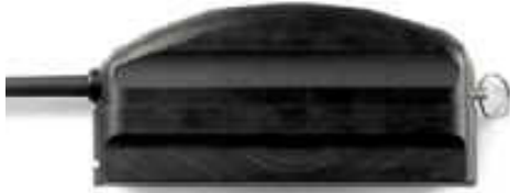
Pie Animal Science Beef Probe