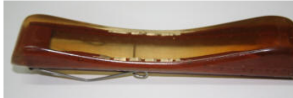
900150 - Pie ASP Beef