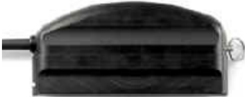
Pie Animal Science Swine Probe