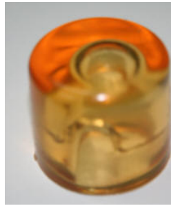
900120 - Pie 50S Tringa Standoff