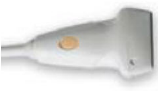
Biosound LA 523