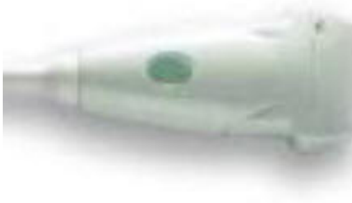
Biosound LA 424