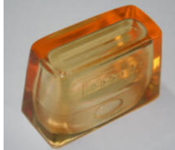
900134 - LA523 / Pie 8Mhz T Standoff